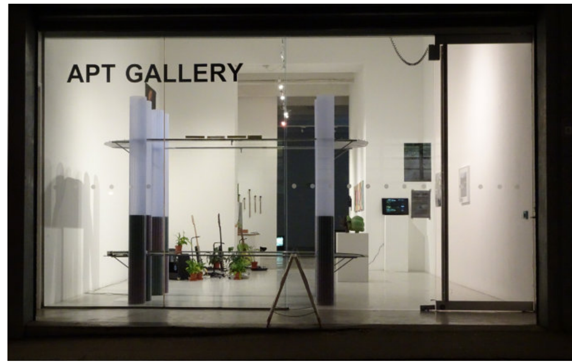
Chlorophilia by night Chlorophilia looking in